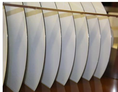
Disc skimming module