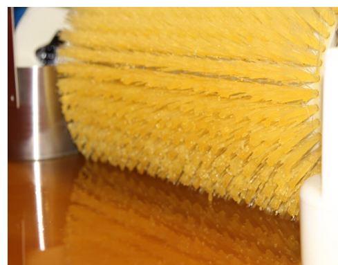
Brush skimming module