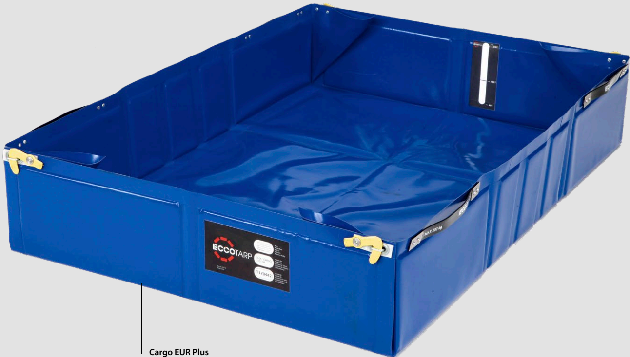
Cargo EUR Plus with side handles