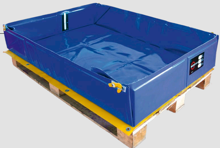
Cargo EUR without the handles

Thanks to shape and size specially designed for use in industry and transportation