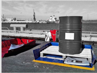
The corners are not sealed and so the tarp can easily fold around the pallet