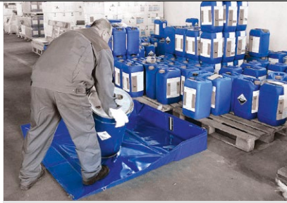
Examples of uses