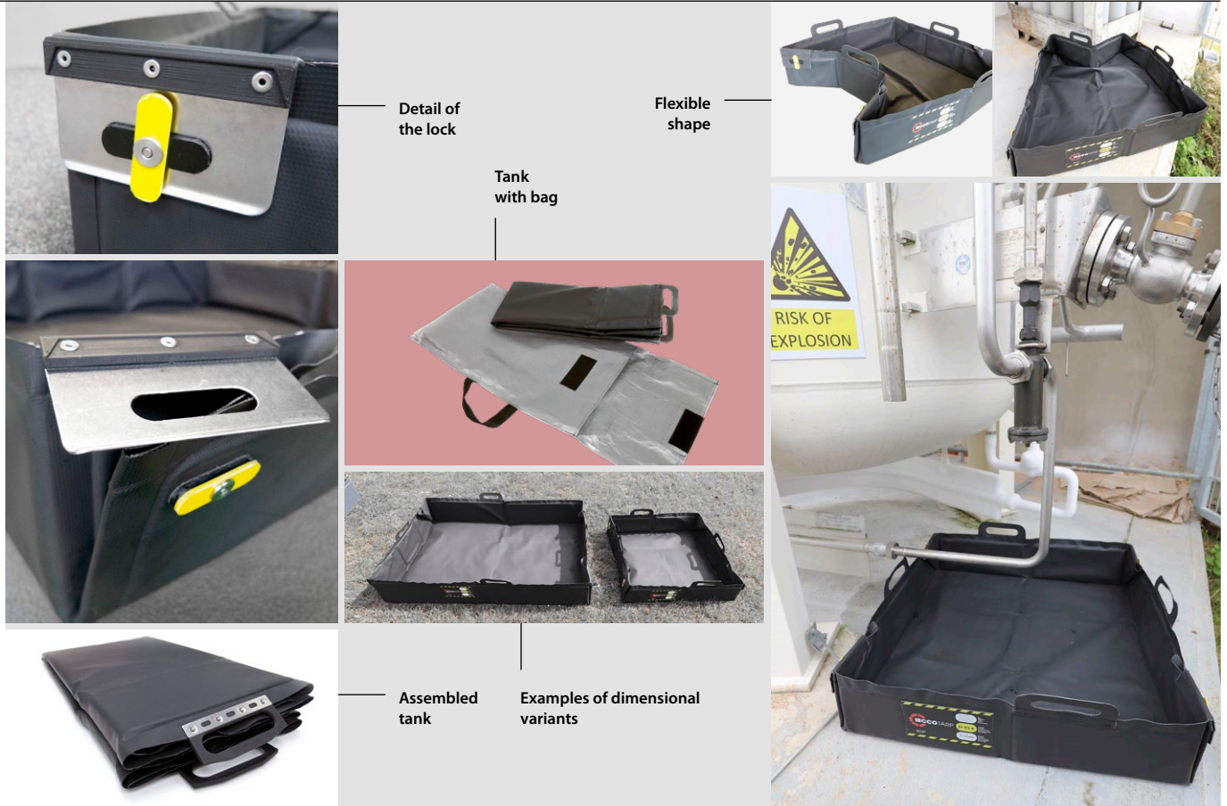
Detail of the lock