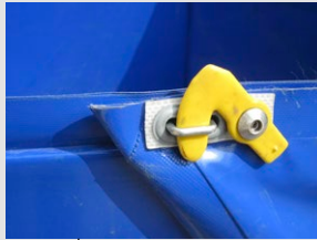
After erecting the hexagonal tarp is fixed with special fastening hooks