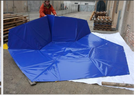
The whole tank can be erected by a single person in minutes