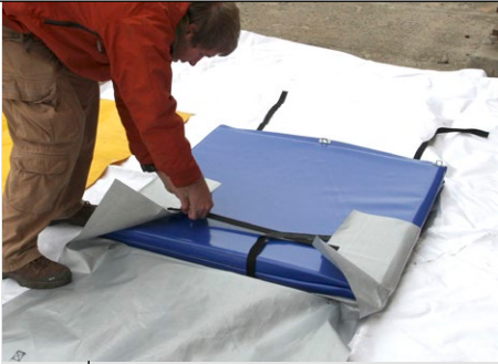
The tank can be packaged to surprisingly small dimensions