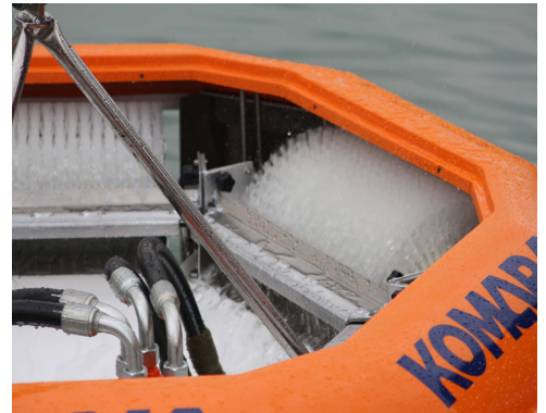
Brush skimming module