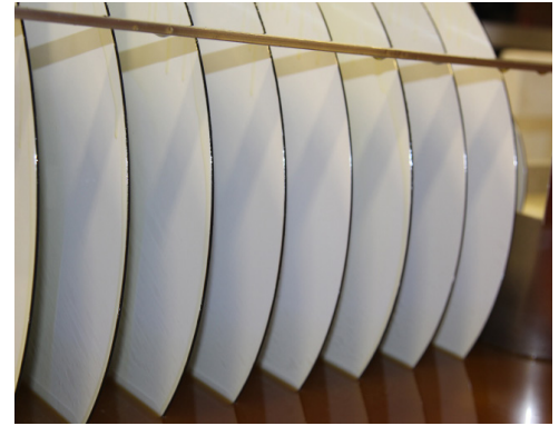
Disc skimming module