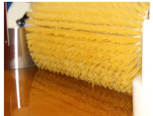
Brush skimming module