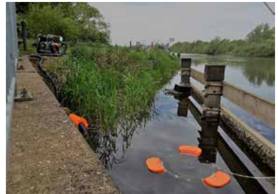
Above: Skimmer connected to pump

Spares Kit Extension hoses Adaptor for Mini Pump