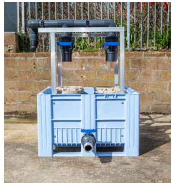
Above: Filtration system