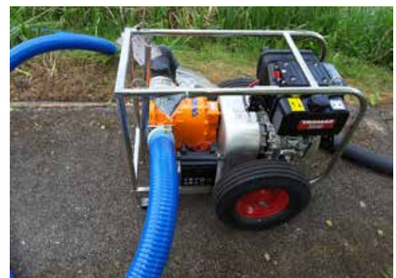
Above: Portable Transfer Pump