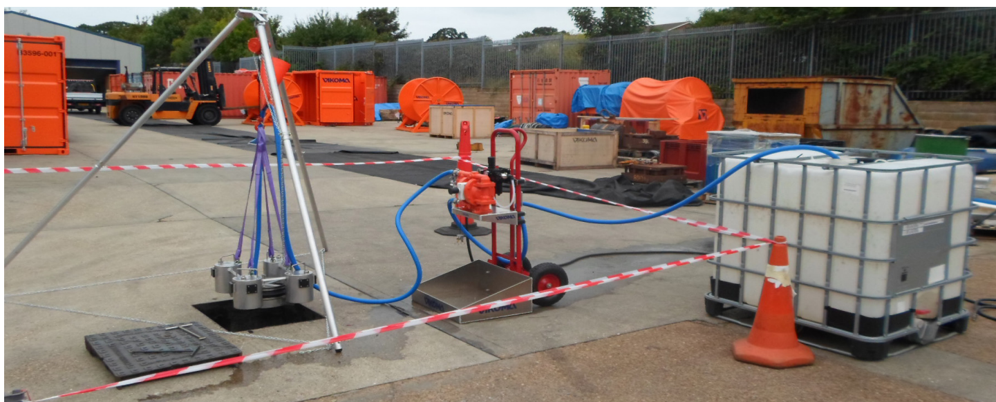
Dragonfly Micro oil skimming system discharging recovered oil into an IBC