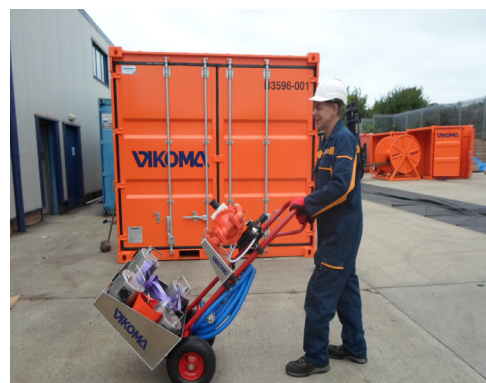
Skimmer and pumps in convenient trolley