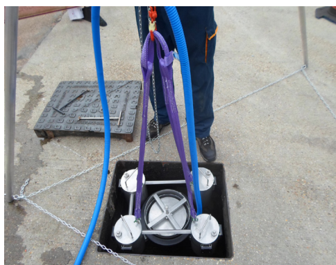
Dragonfly Micro fits into access hole